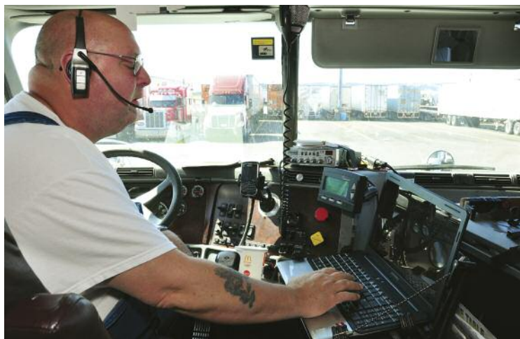
A driver checks his electronic log on his in-cab computer at a truck stop on Interstate 5 near Aurora, Ore.

It wasn't until November 2008 that FMCSA published its third rulemaking, one that still retained the 11-hour limit. The interim final HOS rule went into effect three